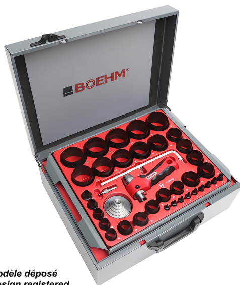
Modèle déposé Design registered